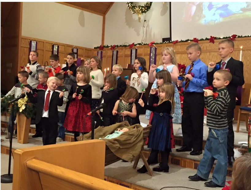
Sunday school Christmas Program