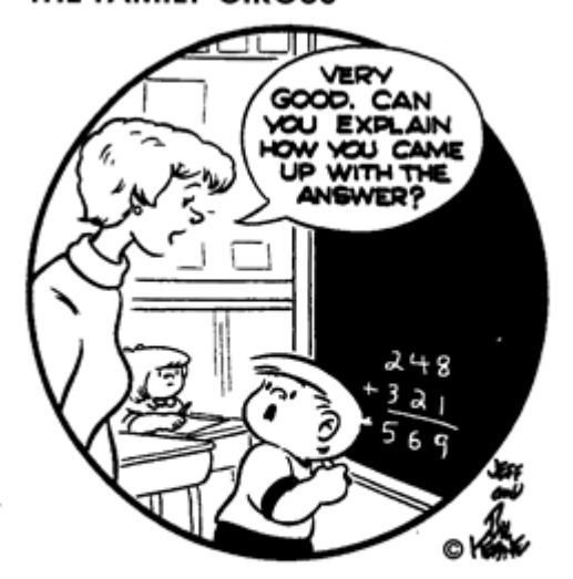
"No, I think it was just Divine intervention."

from JoyfulNoiseletter.com Reprinted with permission of Bil Keane