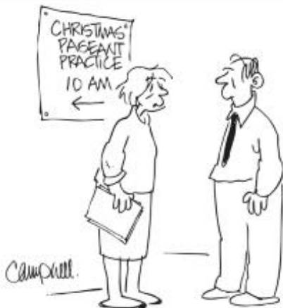
"What a morning! The angels were devils and the wisemen were wise guys."