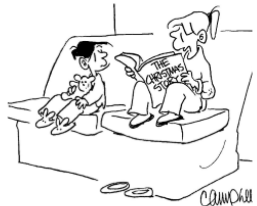
"Because they didn't have e-mail then. That's why God sent an angel to proclaim the baby's birth."