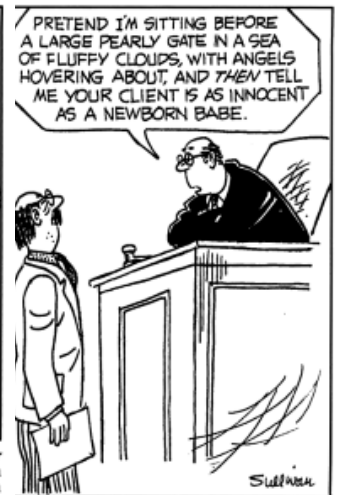
from The Joyful Noiseletter © Ed Sullivan Reprinted with permission

Three French hens stood for faith, hope and love.