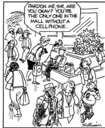
from The Joyful Noiseletter © Ed Sullivan Reprinted with permission

Two turtle doves were the Old and New Testaments.