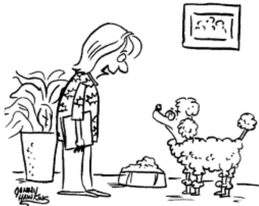
"Guess who got voted to be a sheep in the Sunday school program for the fifth year in a row?!"