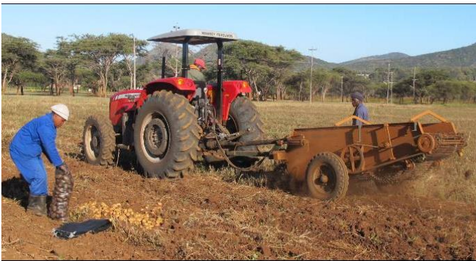
Our new tractor helping harvest potatoes.

Big news on the university farm was the arrival of the new 82 hp Massey Ferguson tractor- at last. Many, many thanks to all who helped make the purchase possible!!!!