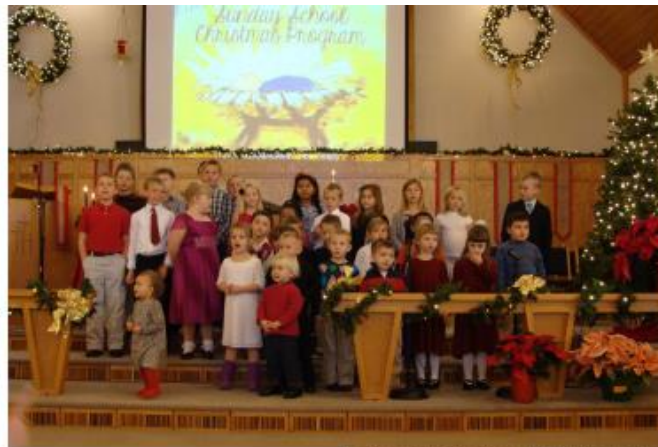
Sunday School Christmas Program