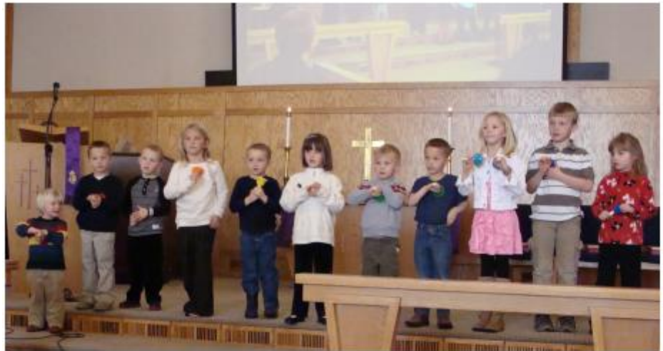
Jr. and Sr. youth bell choir played during service March 16th.